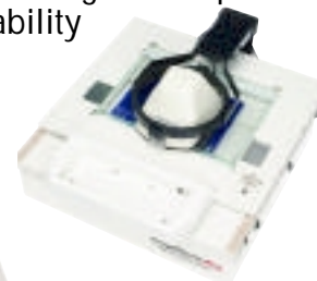
Computer system sold separately.

The ImageMouse Plus carriage gives you cost-effective microfiche scanning with superior stability